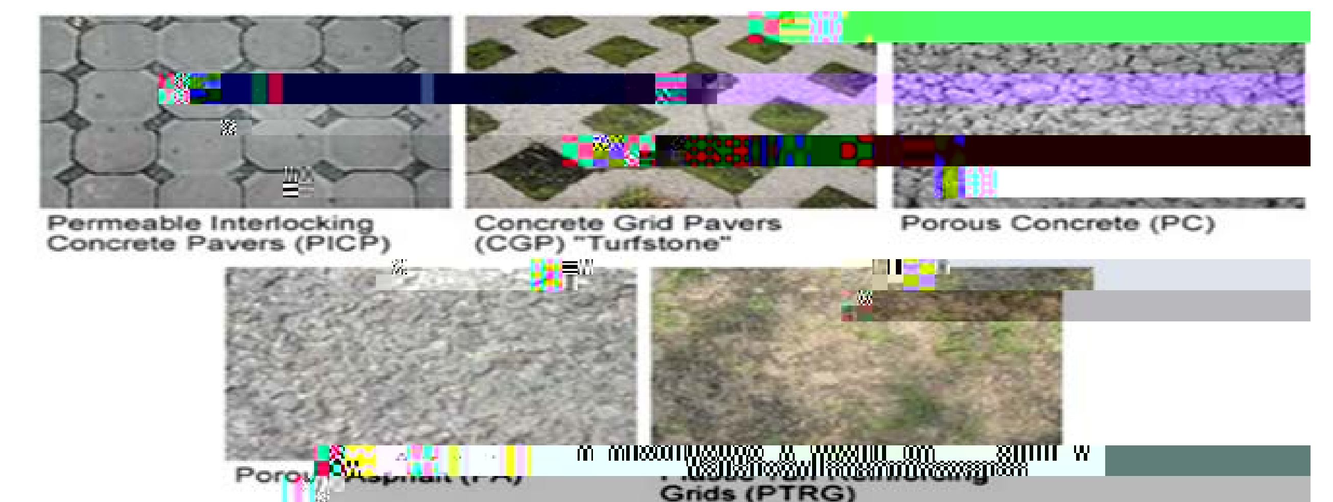
Figure 3: Examples of Permeable Pavements